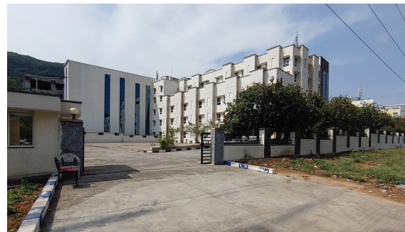
North side gate and building elevation

This ultra-modern facility is planned to be operational in Q2-Q3 of FY 2022-23 and planned to have all major specialties like Medical, Surgical and Radiation Oncology, Renal and Liver Transplant, CTVS, Neuro-Surgery, Cardiology, Orthopaedics, Neurology, Nephrology, Trauma and Critical Care.