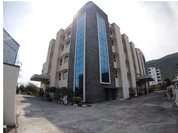
Leased building as seen from the northwest side

This upcoming technology driven hospital, to be completed on a hub and spoke model will cater to increasing medical needs of coastal Andhra Pradesh and surrounding states. Virinchi plans to bring in the best treatment capabilities at this facility, similar to its facility in Banjara Hills, Hyderabad.